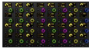
S6 KNOB MODULE