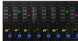
S6 PROCESS MODULE