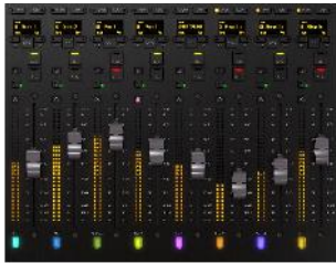
S6 FADER MODULE

Channel modules provide the control and feedback elements you need—from faders and knobs, to processing and metering. All modules feature reliable, high-speed Ethernet connectivity for easy set-up. Mix and match modules in your own custom creation with these choices: