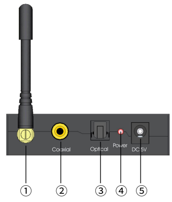
Diagram of Interfaces: