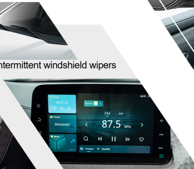
10-inch color display MP5

The A/C cooling rate 36% faster than industry average The air outlet could reach 9.4 °C in 10 minutes under the 43 °C test environment