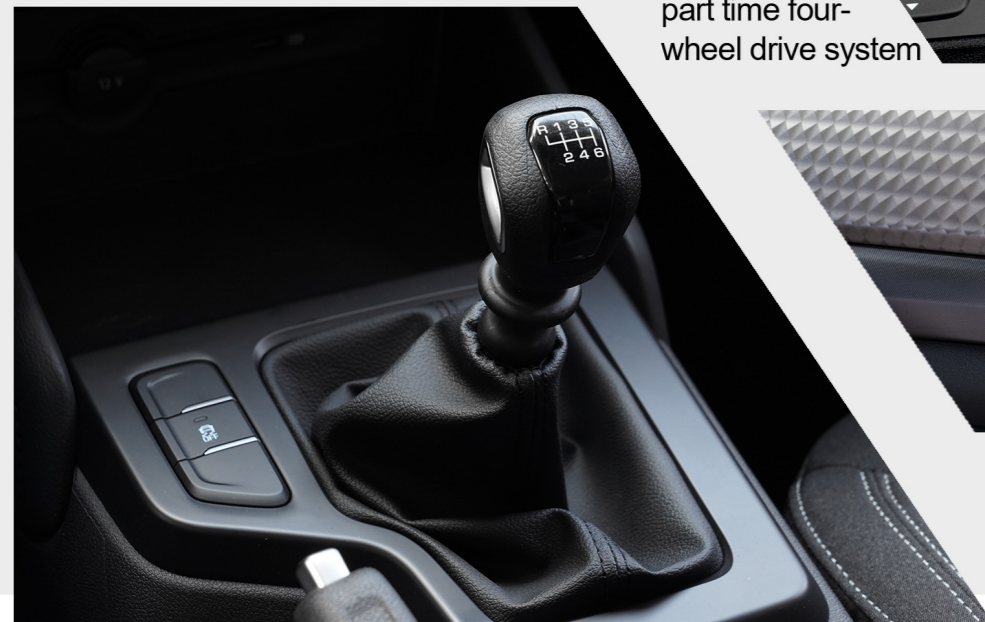
Bogwarner part time four- wheel drive system