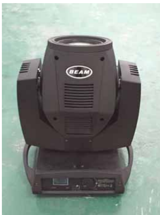
Photo 2 General Appearance of the EUT