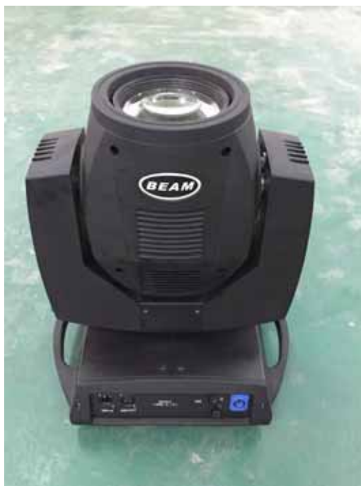
Photo 1 General Appearance of the EUT