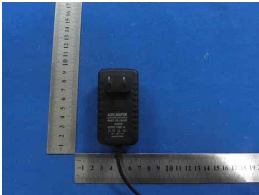
Photo 4 General Appearance of the EUT