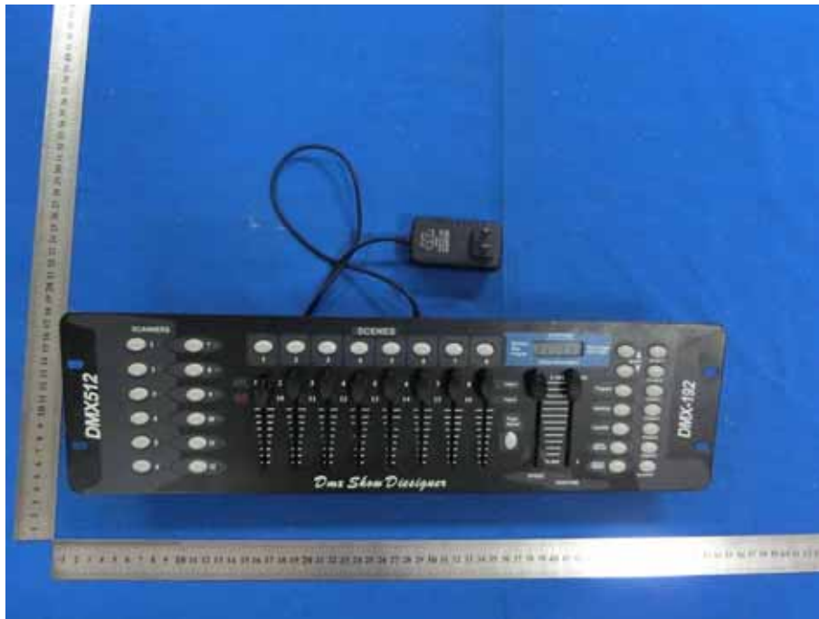
Photo 1 General Appearance of the EUT