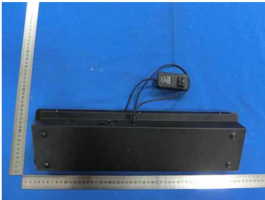
Photo 2 General Appearance of the EUT