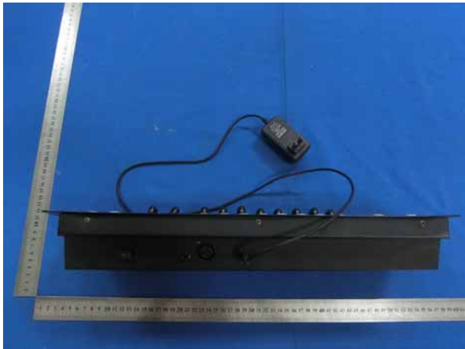
Photo 3 General Appearance of the EUT