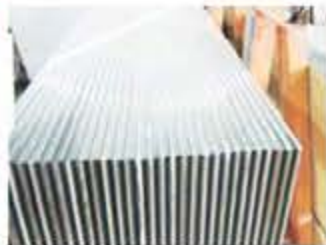
C - POLISHED