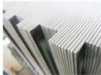
C - GRINDED

Noval Glass can offer many kinds of solutions for Furniture Mirror Edgework mainly including Clean Cut, Grinded, Polished and Beveled. Usually the Furniture Mirror is used in a frame or applied in big piece, so the polished edge (higher price) seems not necessary. And for workers safety consideration, Clean Cut is also not recommended. Thus the most popular edgework for Furniture Mirror is Grinded, Especially C-Grinded (pencil Grinded).