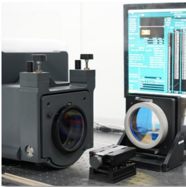
ZYGO Interferometer: parallelism & wave front Parallelism measure accuracy: 0.5 "