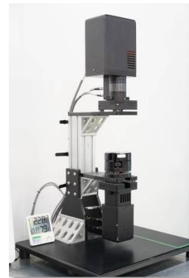
JAW Ellipsometry Retardation Measurement