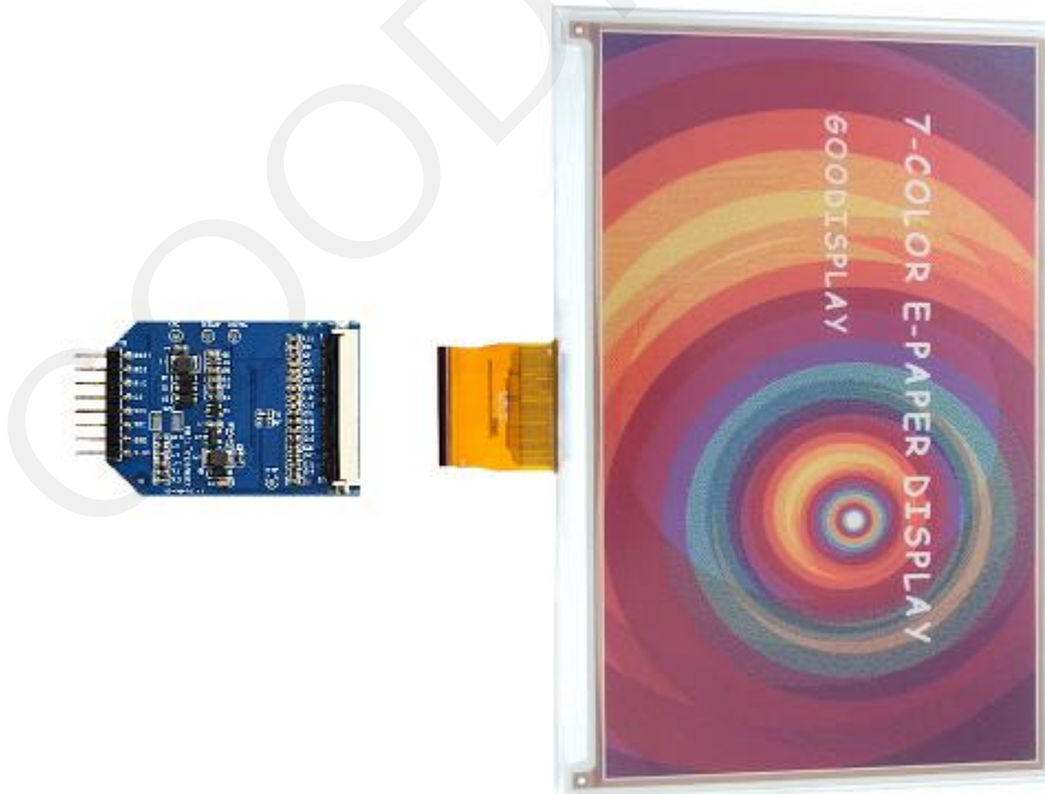
Figure 2 : Connection of E-paper display and Adapter

Note: This connector is a rear lock type. When using it, you need to stand up the switch first, insert the E-paper display and then press the switch to lock it.